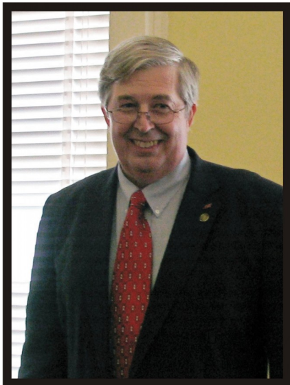
Representative Lea Fite