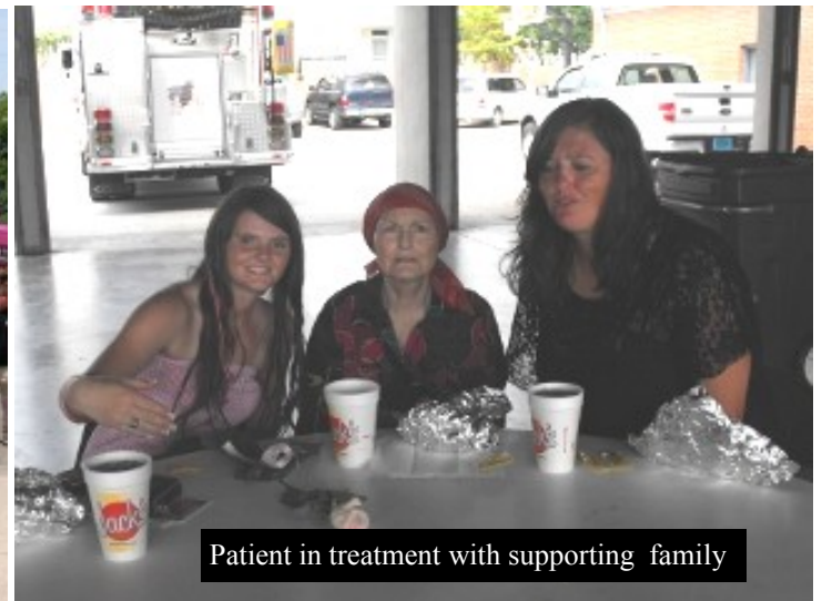
Patient in treatment with supporting family