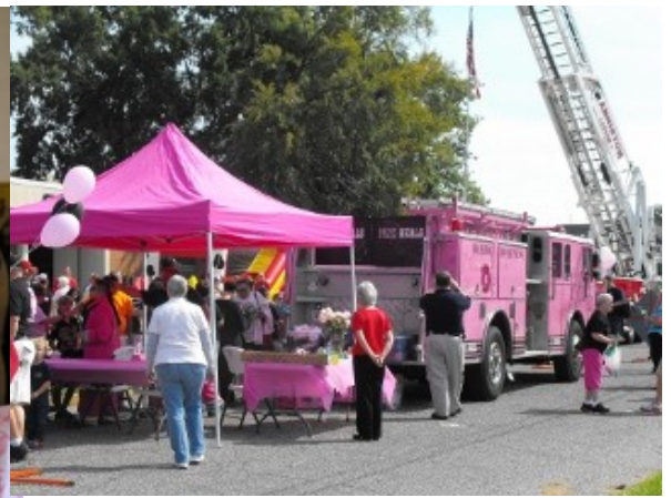
Pictures made at Black Out Cancer event. Anniston Fire Department / with participation of other city and county fire stations.