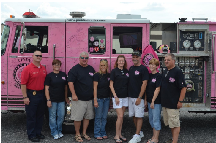
The Anniston Fire Department Family