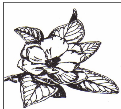
Sharing love through support

How rousing the chill on that crisp October morn;