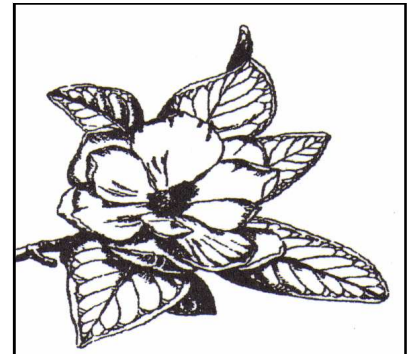
Sharing love through support